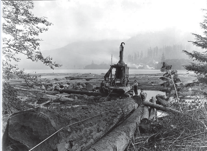
Hauling logs into water with donkey engine, unidentified logging operation, Samish Lake, Washington, 1910

Coffee, juice and donuts will be provided.